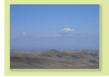
Fig. 2 : Scenery in Armenia Mt. Ararat can be seen in the distance (5,165 m; Turkey); Noah's ark is believed to have drifted here. Many varieties of wild-type wheat plants grow in the arid area in the front of the mountains.

from Armenia. We were based in the capital Yerevan and Ashtarak, and we went out on several day trips to conduct the investigation. Since the southern region of the Ararat basin is extremely arid in summer, the autumn-sown wheat and barley cultivated here require irrigation. In contrast, the northern and eastern regions are highlands, where we observed grazing and spring-sown wheat and barley cultivation. Scheduling a visit according to the harvest seasons is important when investigating genetic resources of wheat varieties. This time, the harvest season and our research schedule matched perfectly and, therefore, we could collect a variety of species of wheat, barley, rye, and related wild-type species (Fig. 2). However, we could not collect the seeds of the wheat species in the mountainous region because most of the plants here were still before or in blossom.